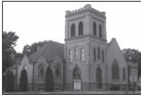
Albion First United Methodist Church

Beginning in 1980, the church awarded scholarships in amounts ranging from $250 to $500 annually. The total amount of scholarships awarded through June 30, 2006, $11,500, now exceed the church's total